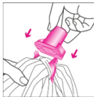
Fit mop head into socket