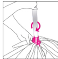
Secure socket with handle